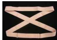
String or Rubber belt (At least five of