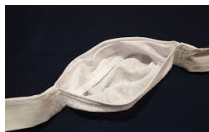
↑ Obimakura Cover (If there is gauze, it is unnecessary)