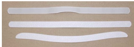
The Erishin has a kind, but a thin thing is recommended