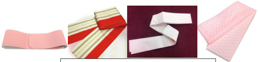
Datezime Any OK (Two of them)