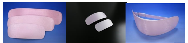
The front (Big) & The back (The back) ↑ There is