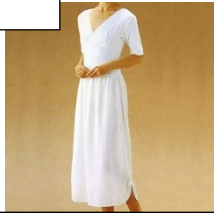
Lingerie in Kimono-style