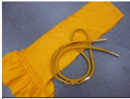
Obiage • Obizime