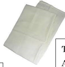
Towel (Size to wash the body) Approximately 5~6 pieces