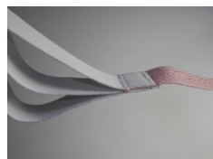
Obi Exclusive sanjyuhimo (One of them) (Furisode Exclusive)